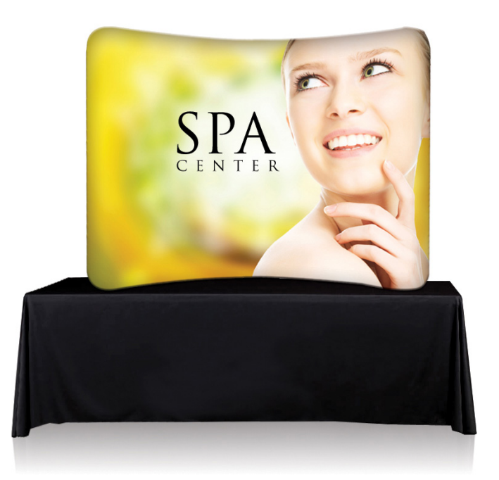
Table is not included.