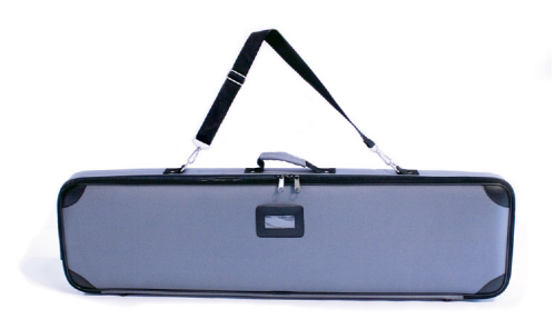
Snap Tube Tabletop Case (Included)