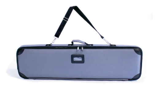
Snap Tube Tabletop Case (Included)