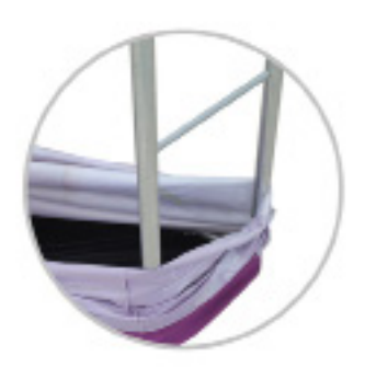
Step 11 Locate the pre-drilled hole on the top base. Make sure this hole aligns with the finished hole on the graphic.