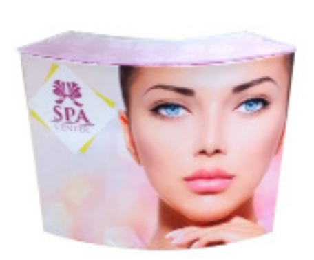
Step 13 The install is now complete.