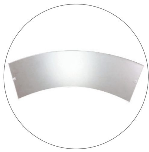
Qty 1 - Acrylic Top Counter