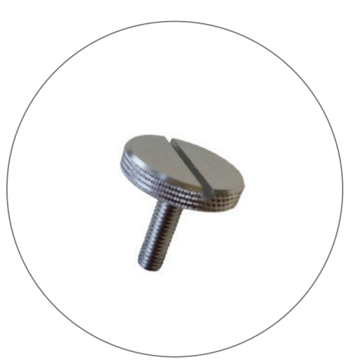
Qty 2 - Large Head Bolt