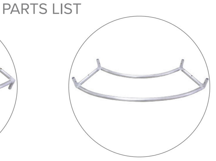
Qty 1 - Bottom Base