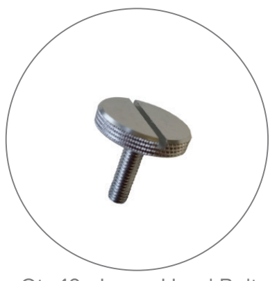
Qty 10 - Large Head Bolt