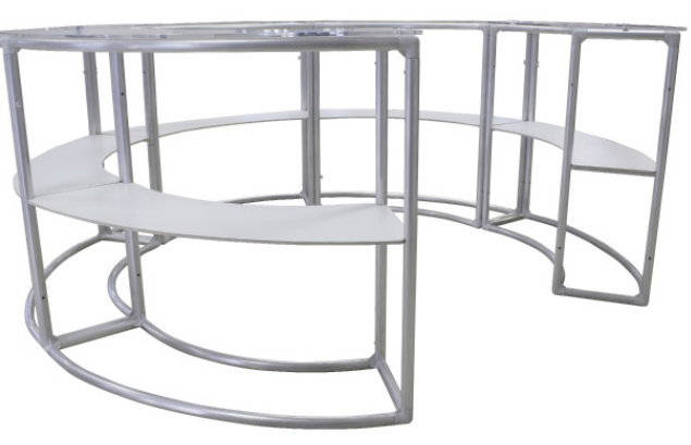
Optional Curved Shelf