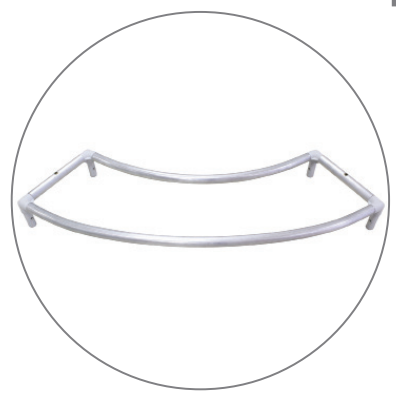
Qty 5 - Top Base (Pre-drilled for acrylic counter)