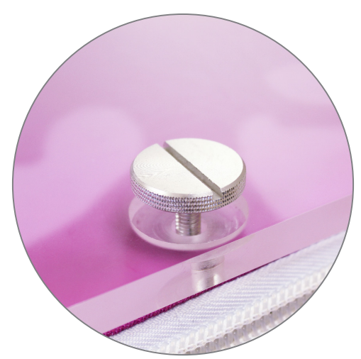
Insert head bolt.