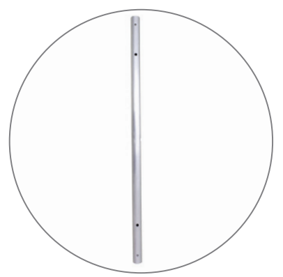
Qty 20 - 33" Vertical Support Bar