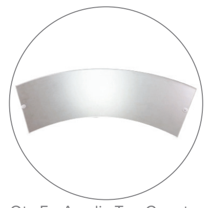
Qty 5 - Acrylic Top Counter