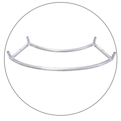
Qty 5 - Bottom Base