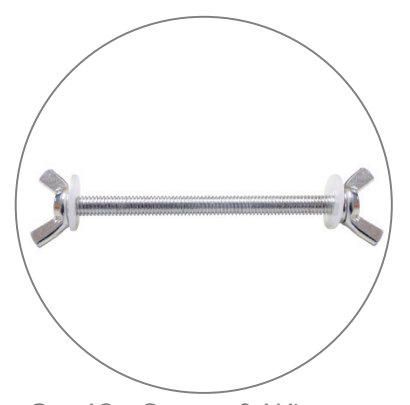
Qty 16 - Screw & Wingnut