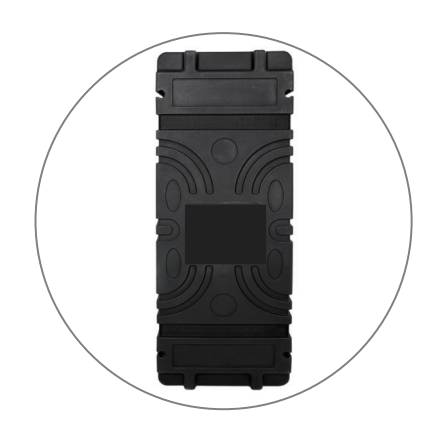
Qty 1 - Hard Case