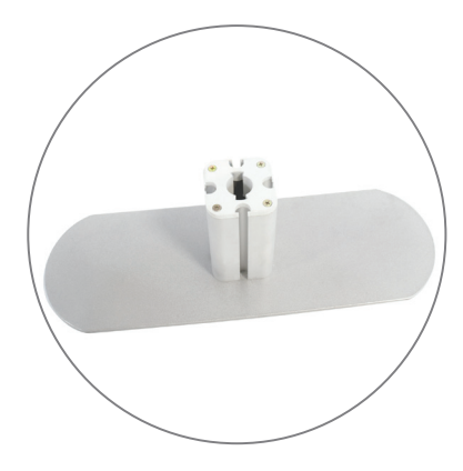
Qty 3 - Feet