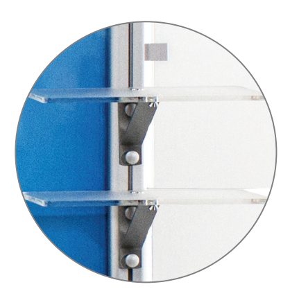
Qty 3 - Small Acrylic Shelves with Brackets