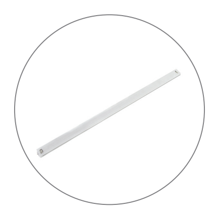
Qty 4 - Horizontal Extrusions