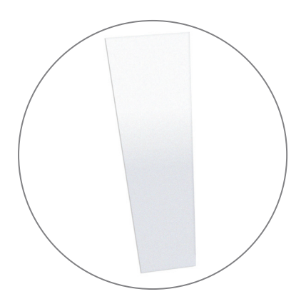
Qty 4 - Acrylic Wings with Brackets