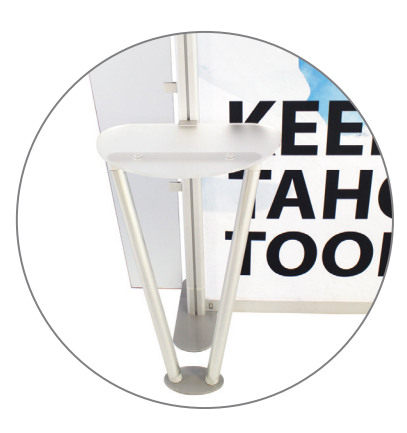
Qty 1 - Acrylic table with Brackets