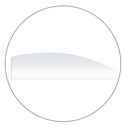
Qty 1 - Acrylic Header with Brackets