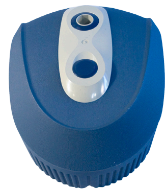
Shaggy Base: Base Size: 14"W x 7" H x 17" D Water Capacity: 40 lbs