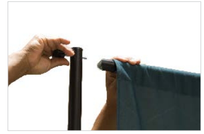
Clutch lock offers secure horizontal and vertical adjustments.