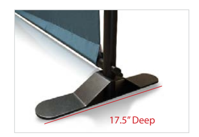
Sturdy Steel "Bridge" Support Base.