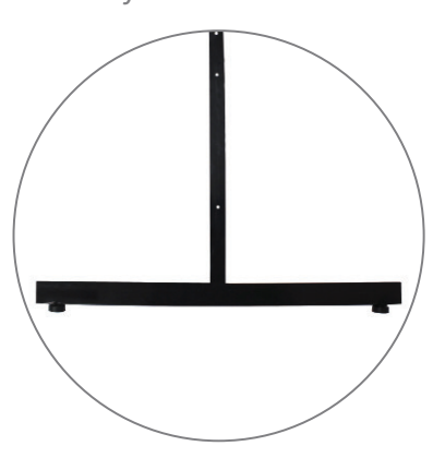
Qty 4 - Steel Base