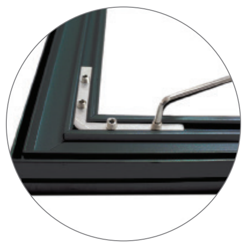
Tighten all socket screws.