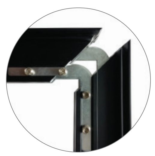
Insert adjacent extrusions together.