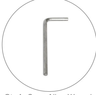
Qty 1 - 3mm Allen Wrench