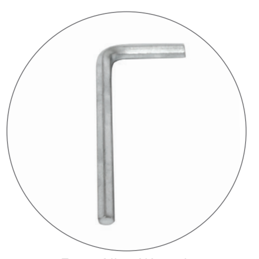
5mm Allen Wrench