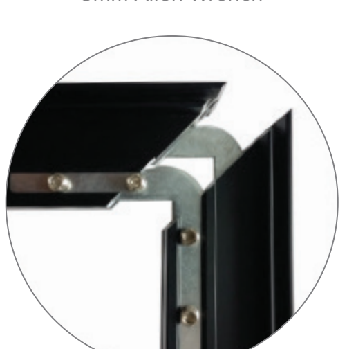
Insert adjacent extrusions together.