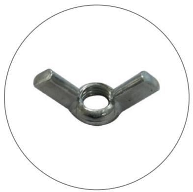
Qty 2 - Wing Nuts