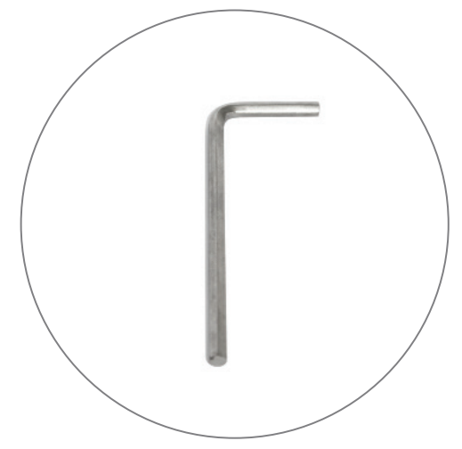
3mm Allen Wrench