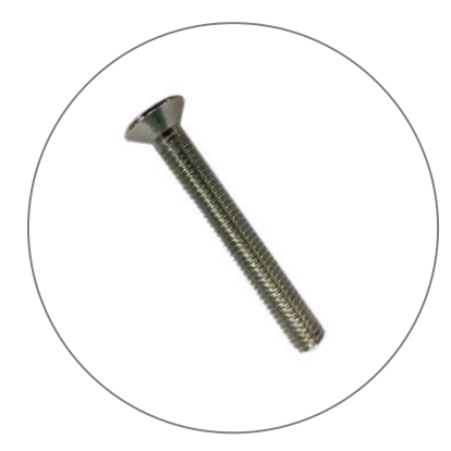
Qty 2 - Socket Screws