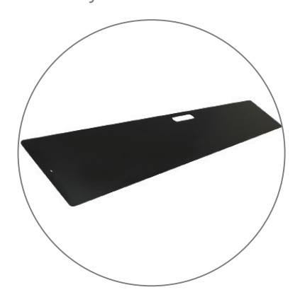
Qty 4 - Steel Base