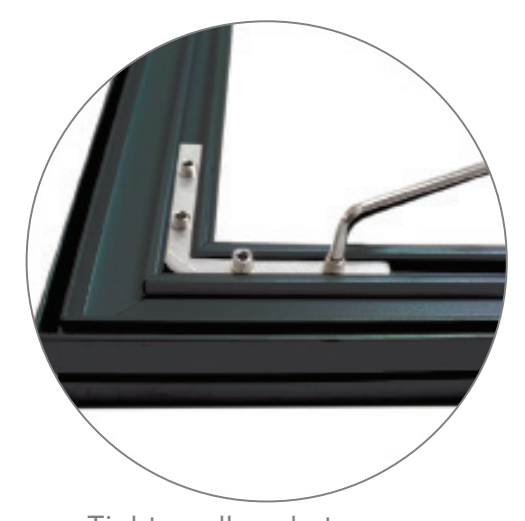
Tighten all socket screws.