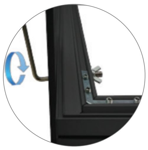
Then screw and tighten.