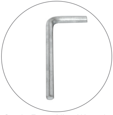
Qty 1 - 5mm Allen Wrench