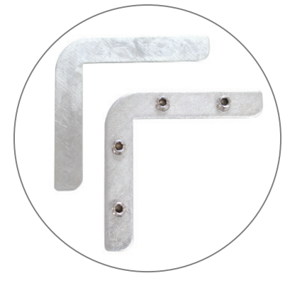
Qty 16 - Comet Corner Connectors