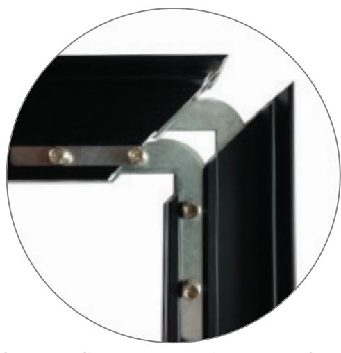
Insert adjacent extrusions together.