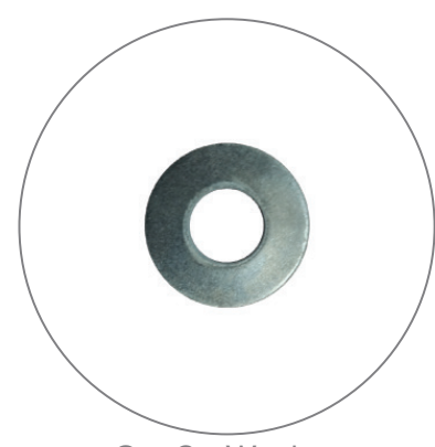
Qty 2 - Washer