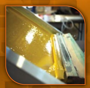
Laser Etching Process